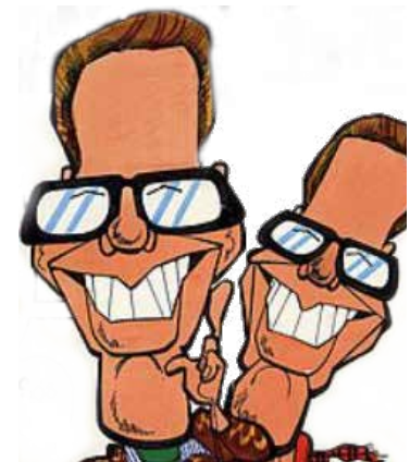
A huge hit for the Leith-born duo The Proclaimers in 1988, 1993 and 2007.